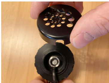
3) Demount the cover and put it aside.