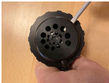
2) Using a flat-bladed screwdriver or a similar tool, lift the cover of the thermo-valve power cord.