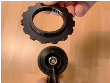
5) Remove the locking nut.