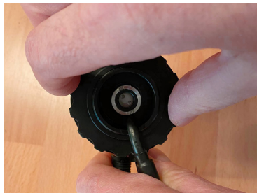
4) Unscrew the locking nut.